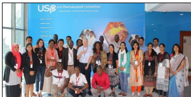
Trainees at United States Pharmacopeia Facility, India