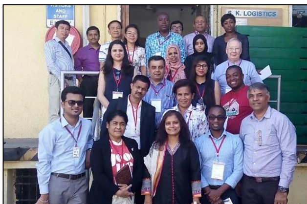
Participants at SK Logistics (ISO Distribution Facility), India

"This course was one of its kind in my career and hopefully will add value to my management and leadership skills in South Sudan. I have learnt a lot and now I am able to deliver and ensure that the people of my country have access to quality, safe and effective health product."