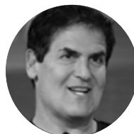
Mark Cuban ABC's Shark Tank Owner, Dallas Mavericks