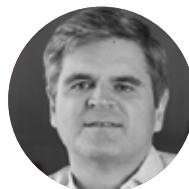
Steve Case Chairman The Case Foundation